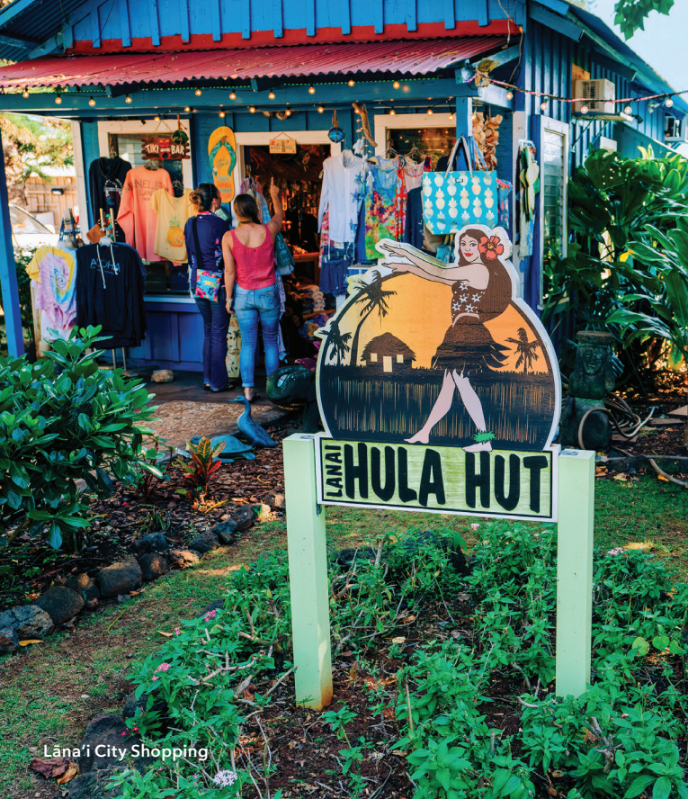
Lānaʻi City Shopping