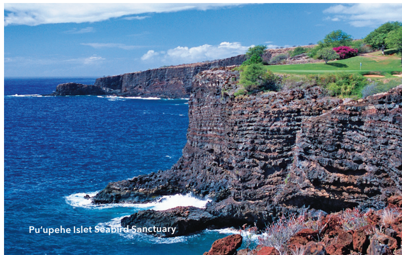
Pu'upehe Islet Seabird Sanctuary