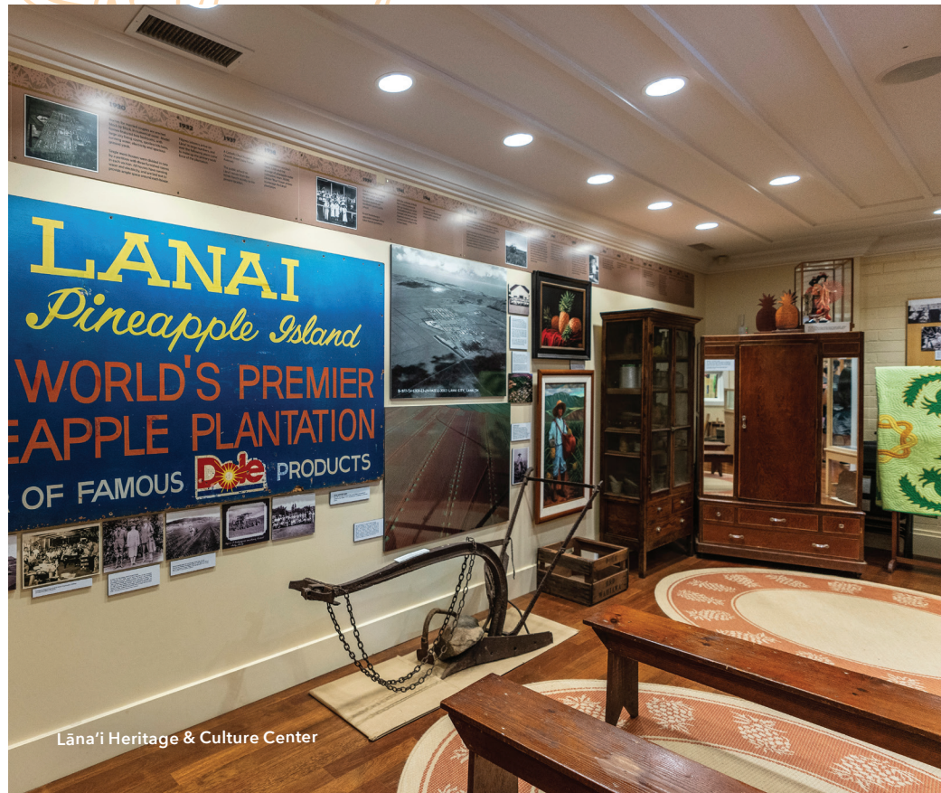
Lānaʻi Heritage & Culture Center