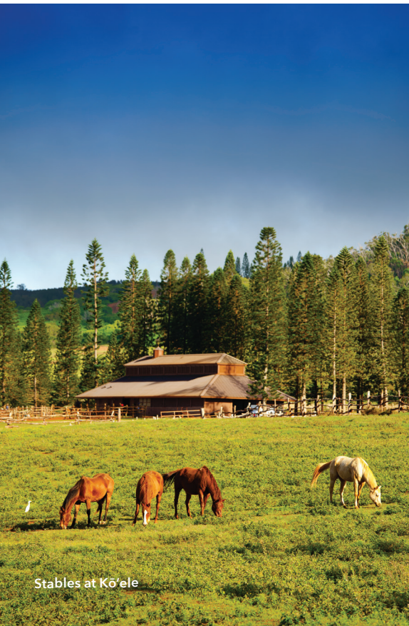
Stables at Kōʻele

The whole family can enjoy the luxury and charm of Lānaʻi. Please note, however, that Sensei Lanai, A Four Seasons Resort, is exclusively for adults.