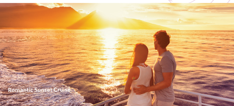
Romantic Sunset Cruise

Among the many family-friendly activities available on Maui are chocolate tours, aquarium visits and farm tours.