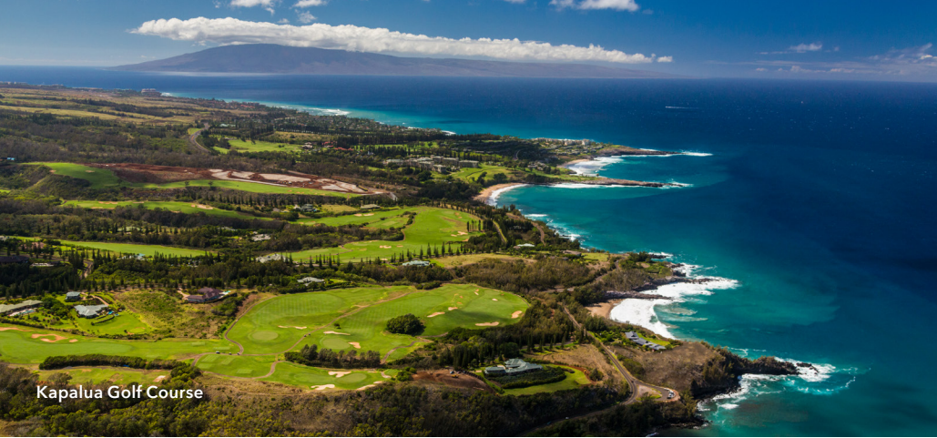
Kapalua Golf Course