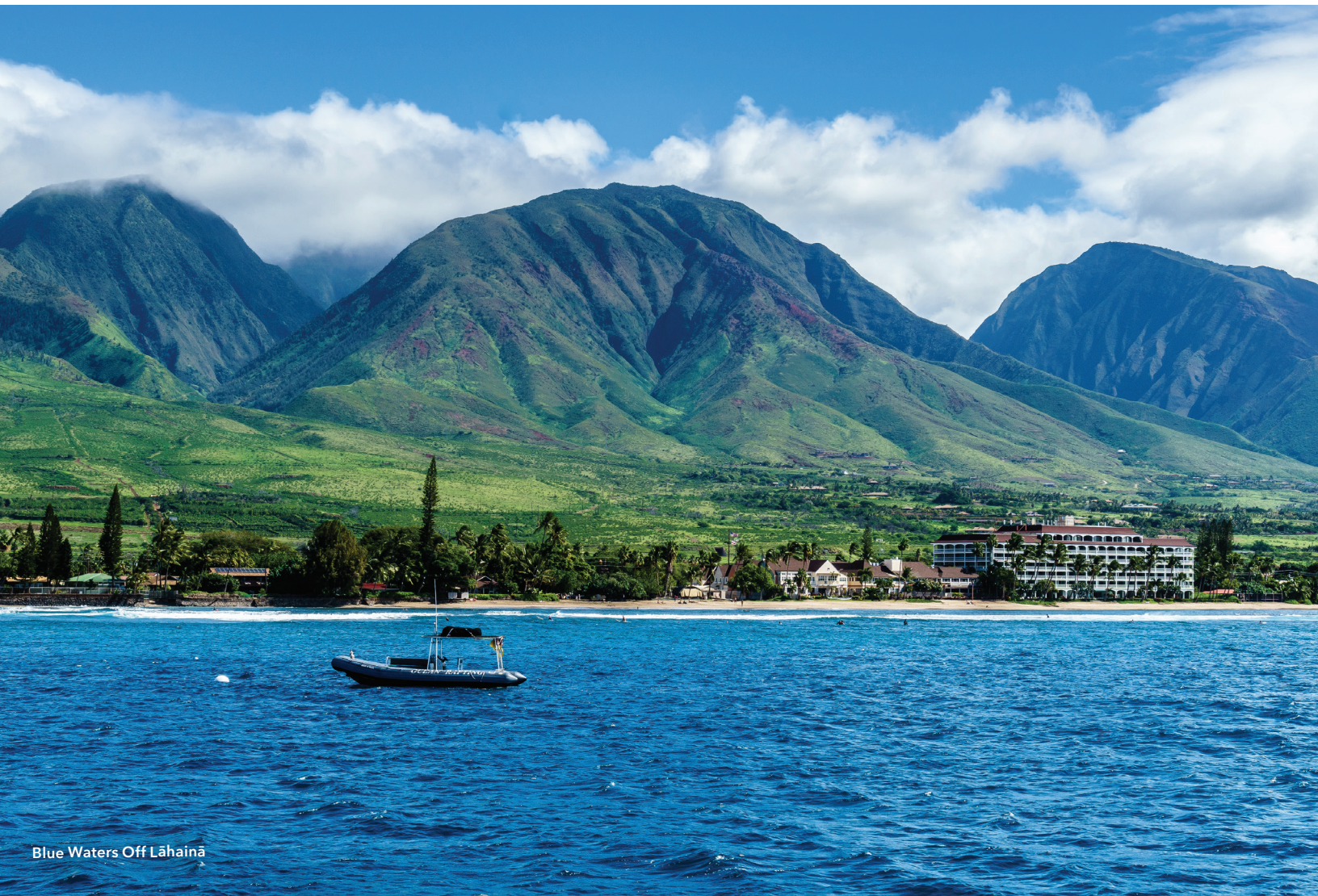
Blue Waters Off Lāhainā