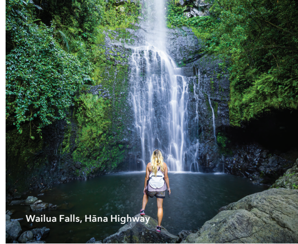
Wailua Falls, Hāna Highway